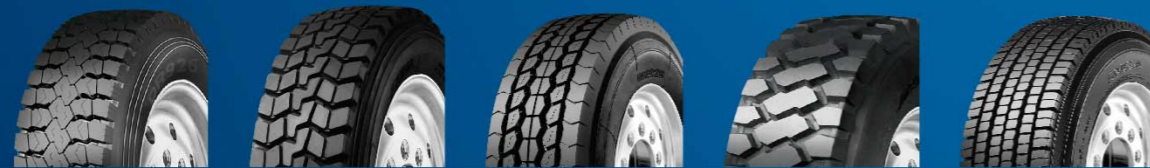
DR926 DR928 DR929 DR930 DD932