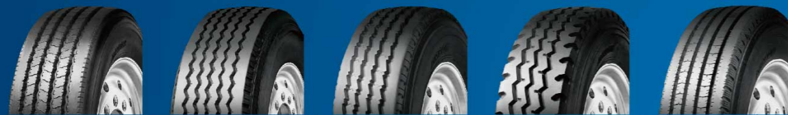
DR902 DR905 DR906 DR908 DR909