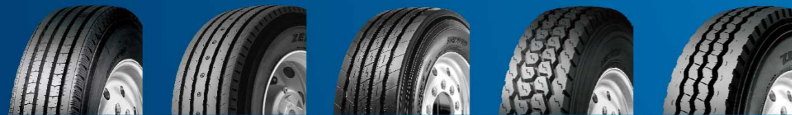
DR909D DR910 DR919 DR920 DR921