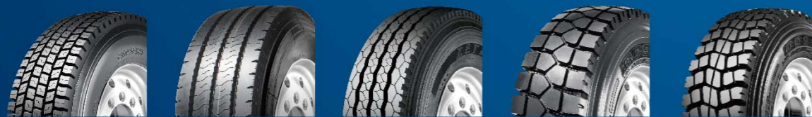
DR938 DR958 DR966 DD978 DD988